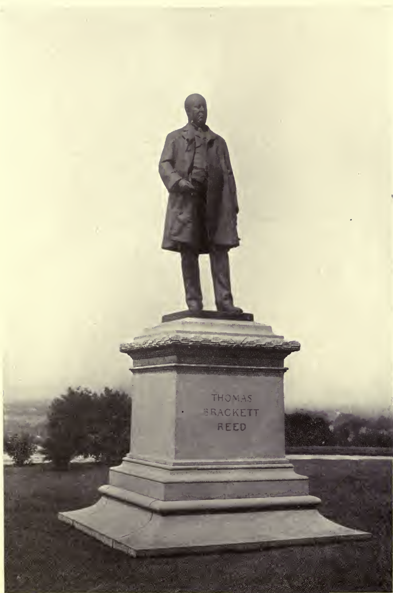
THE PORTLAND STATUE